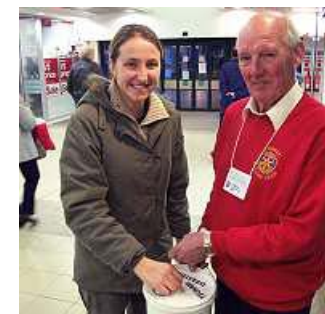
This picture and report, by CJ-G, was in the Pudsey Times 13/1/05

The weather was wet and blustery but the shoppers were out in force, and attracted to our display were soon dropping lots of money into our collection buckets. The Aquabox team were well supported by members, their wives and friends and it was all worth the effort as we counted just over £1100.00.